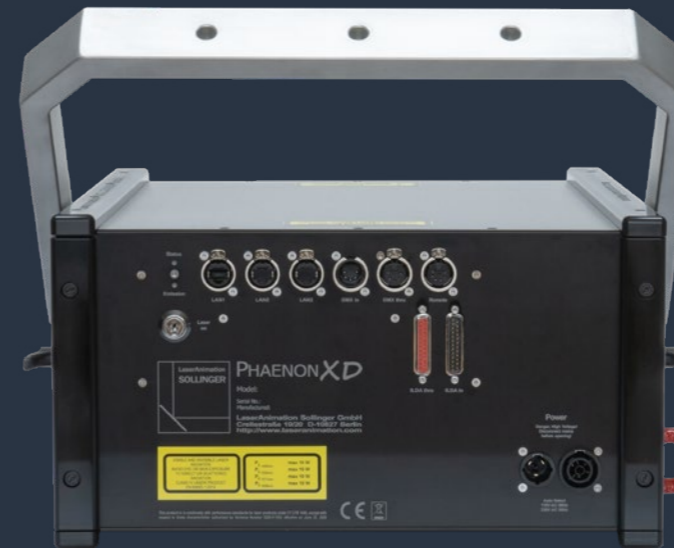
PHAENON XD COMPACT HOUSING